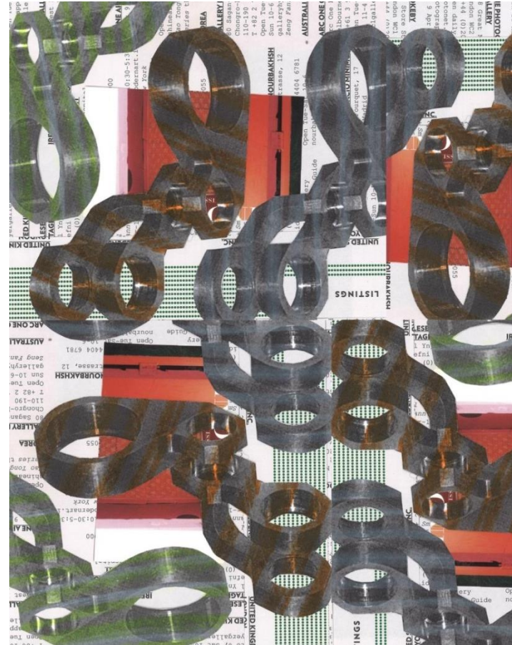
Example collage by Year 9 student