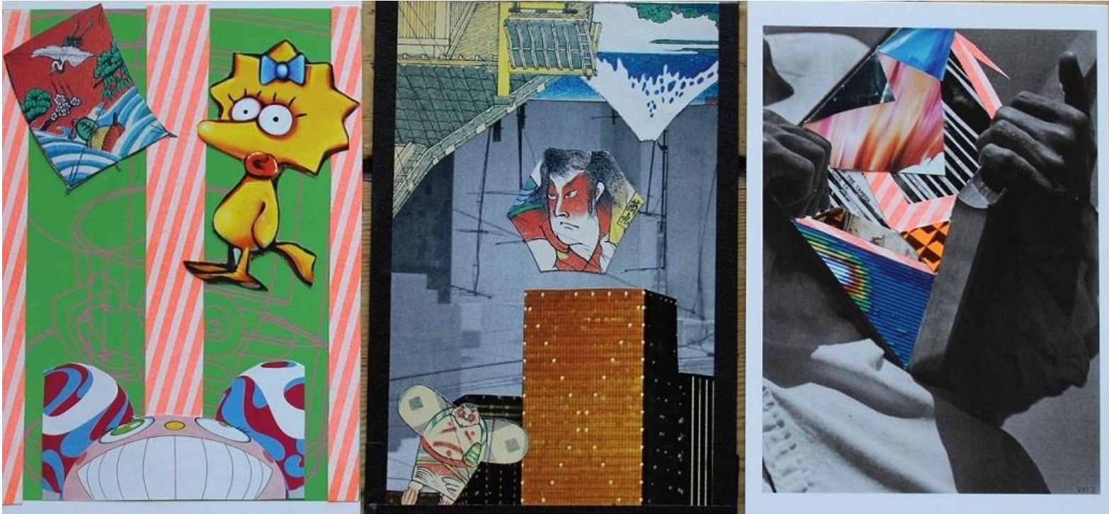
Collage series by year 10 student

This activity is a great introduction to collage. Using a postcard image as a starting point, play with the juxtaposition of cut out images and patterns from magazines. Creating a series of small images is a useful way to get started with collage.